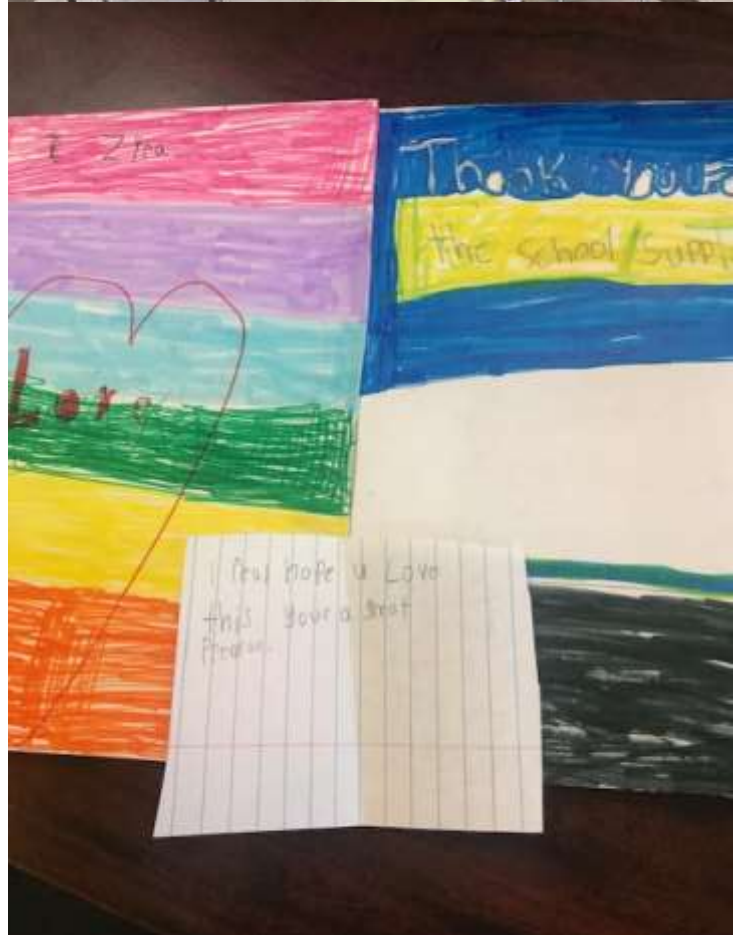
Above: Middle school students display thank you notes and below: more thank you notes written by students.