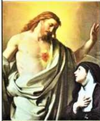
St. Margaret Mary Alacoque 1647-1690